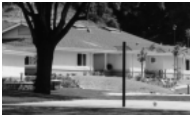
Located in the upper campus of Hillside, two new cottages were built to house ten children each. Adjacent to these homes are a playground and pool for cooling off during the summer months.