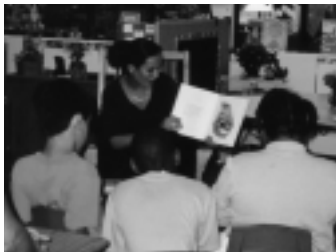
Starbucks treated the children of Hillside to an exciting treat and goodies during a recent visit.