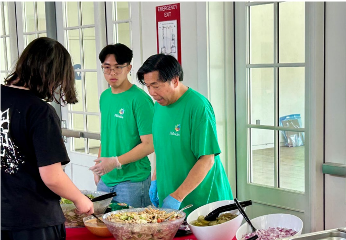
Volunteers serve lunch at a summer kick-off celebration!