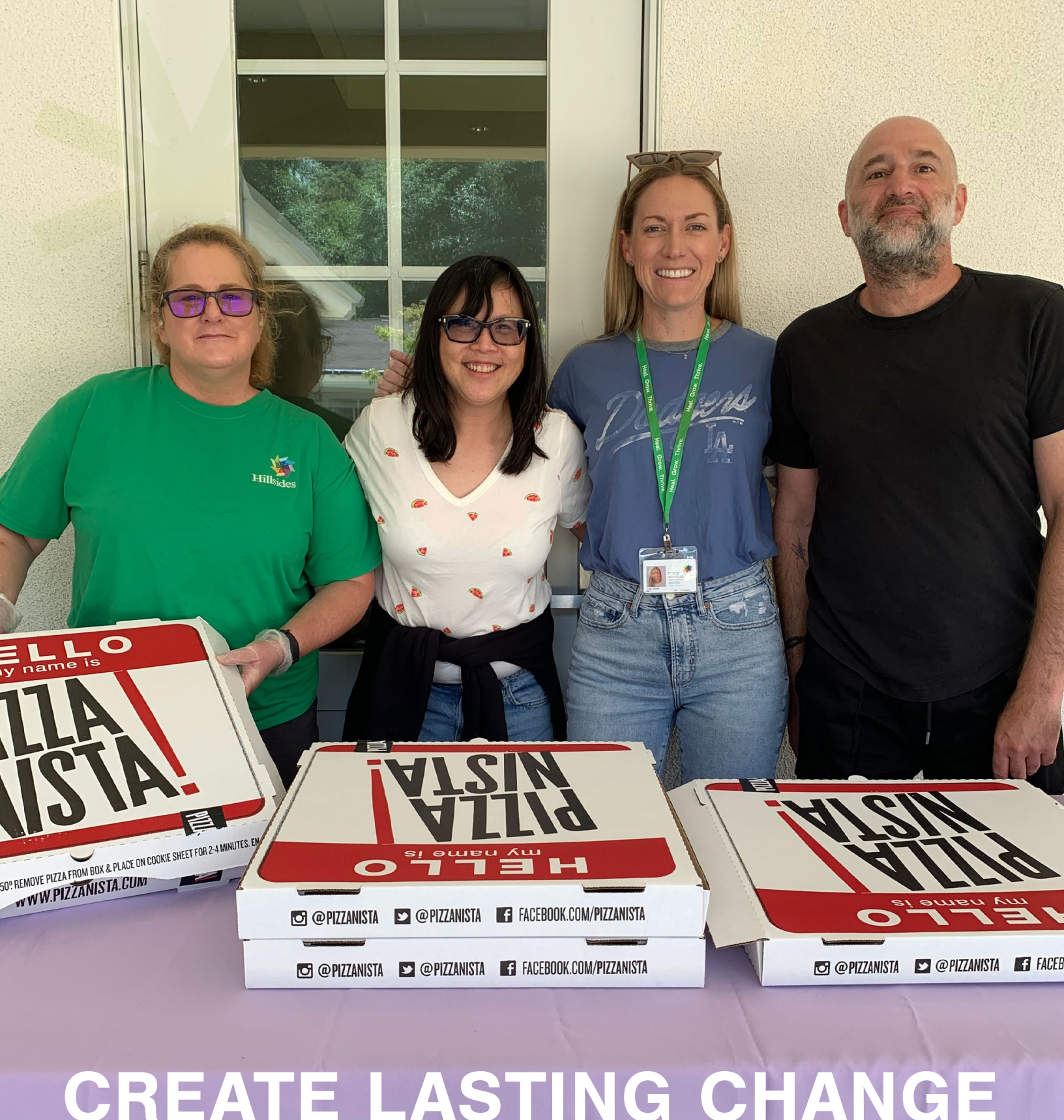
Special events are held monthly to spur childhood memories and moments of joy for our clients.