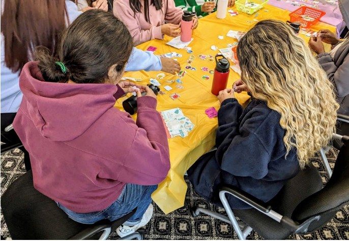
Children get creative and decorate their own water bottles to stay hydrated.

Our Hillside's volunteer community plays a critical role in helping us to provide the highest quality of care to the children, youth, and families that we serve. We are fortunate to have the support of hundreds of volunteers across three different support groups, and a sizable number of community-based groups who, through their time, talent and resources, help spread joy to the children, youth, and families within our care.