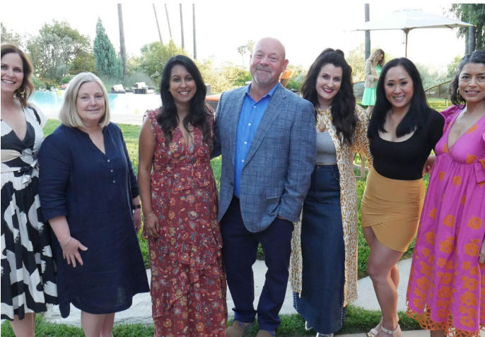
Members of our support groups raise funds at the annual Farm to Table event.